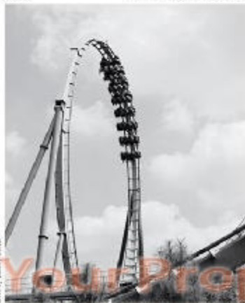
The transformation of Six Flags' Supernova: Ride of Steel is causing excitement and concern over LexCorp's role.

the "number one coaster on the planet." Aetheria is a historic ride which was the first "Wooden" roller coaster when it opened in 1955.