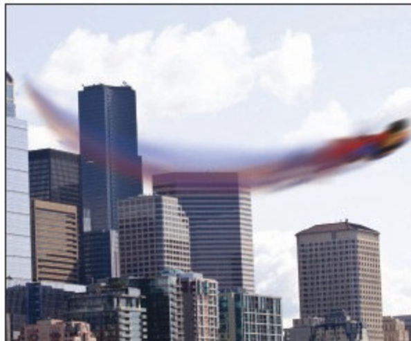
The streets of Metropolis are safer than ever with a continuing trend of crime on the decline.

"It was the darnedest thing I ever saw! A streak of red and blue shot past the window," John, the train engineer, later related. He went on to say, "That's when I heard the wheels grinding, screeching to a halt. Like someone put the brakes on the whole train." The sound John heard was Superman pushing against the engine. Exerting more power than the locomotive, Metropolis' favorite son quickly had the train stopped dead in its tracks. With blinding speed, Superman then dis-