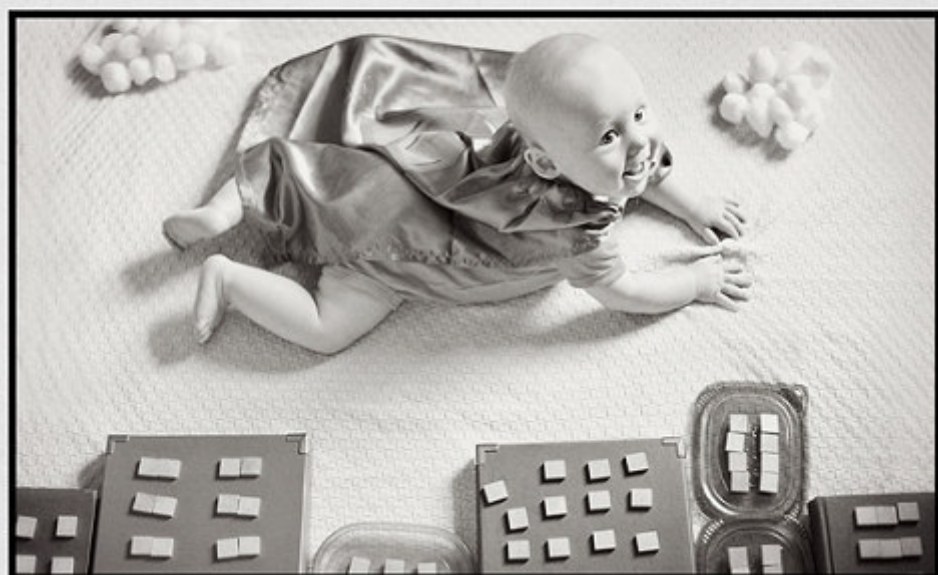
Clark flies over the city during a nice day in May.