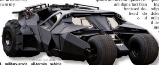
A military-grade all-terrain vehicle known as the "Batmobile."

Enisl inim ilit amcon er sim dit prat aut lam, consequatem verit nis dignis nisl ip etuerci ent ad exerit lam qui blan-utpudet ad magna facillam dolenis em-sandiamet lamet adio ea corlio odolore eraessent nulla feugait wis et, commy