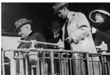
LAST KNOWN PICTURE OF PRESIDENT HARDING

Teapot Dome, an oil reserve in Wyoming, was deemed public land soon after its discovery by President William Taft. It was decided that the oil would be set aside for use exclusively by the US Navy in 1912. It was believed by many politicians and private oil companies that American oil companies could provide for the Navy, and resented the decision. Albert B. Fall, Secretary of the Interior as of 1921, convinced Secretary of the Navy Edwin Denby, that Fall should take over control of the reserves in Wyoming as well as those in Elk Hills, California. Soon after, Fall allowed two of his friends, Edward L. Doheny