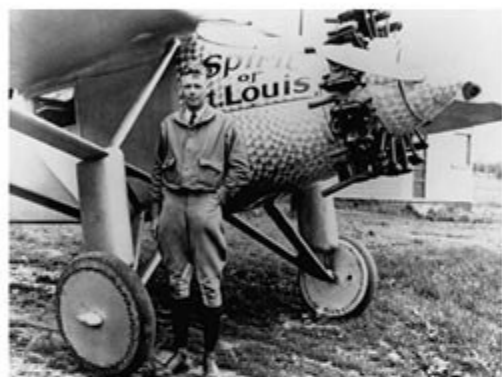
LINDBERGH WITH HIS PLANE, THE SPIRIT OF ST LOUIS