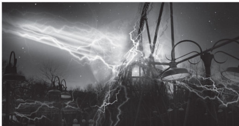
Amazing light display in the sky over the Superman: Ride of Steel .

Some onlookers described the coasters as being "transformed" after