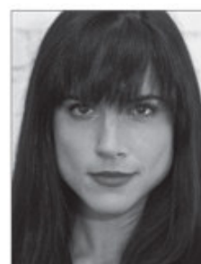
Lois Lane: Staff Photo

You can also follow the story as it develops on my blog at: LoisLaneReports.com .